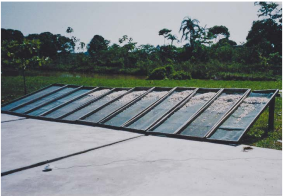
Figure 2 Set of eleven racks angled at 30° towards the sun

To help with drying, the product should be turned frequently using hand brooms. If rain is expected, the racks should be taken under cover immediately. Using this type of rack, drying should be completed within six to eight hours.